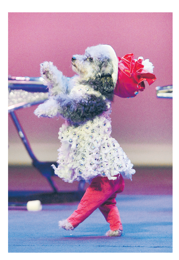
The show included a fashion show, when the dogs strutted across the stage on two legs wearing sparkly dresses, hats, Mariachi costumes and tuxedos.

Kristen Fiore is a staff writer with The Villages Daily Sun. She can be reached at 352-753-1119, ext. 5270, or kristen.fiore@ thevillagesmedia.com.